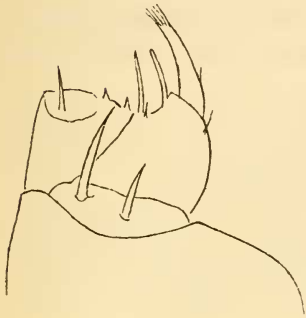
Fig. 1. Eub. instrenuum 75 / 1 . [maxilliped apex.]